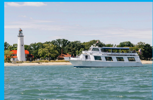
Door County Sister Bay Scenic Boat Tour Lake Michigan