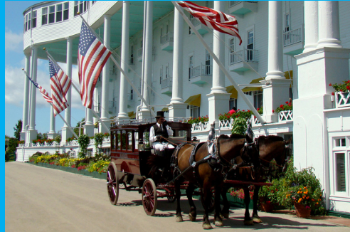
Lunch at the Grand Hotel Mackinac Island