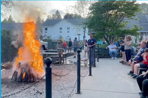
Pelletier's Restaurant & Fish Boil Door County, WI