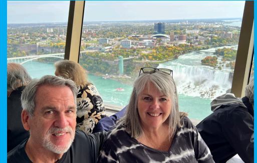
Skylon Tower Revolving Restaurant Niagara Falls

in at the Drury Inn, where we'll enjoy their famous Kickback Supper. It's the perfect time to relax and reminisce about all the incredible experiences we've shared on this tour. From the stunning shores of Lake Michigan, Superior, Huron, Ontario, and Erie to the unforgettable cruise at Niagara Falls, this Great Lakes adventure has left us with memories to treasure. What an inspiration this journey has been! Let's start dreaming about our next adventure together. What do you think? Overnight: Springfield, Illinois (B, D)