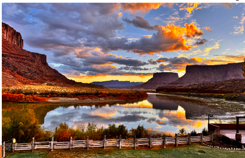
Photo at left is at Red Cliffs Lodge

is on the banks of the Colorado River at the foot of dramatic red rock cliffs. This evening you will be impressed at our surroundings as we enjoy a Cowboy Cookout. Red Cliffs Lodge will be our home for the next two nights, so enjoy listening to the Colorado river flow as you fall into a relaxing sleep each night. Overnight: Red Cliffs Lodge, Moab, Utah (B, D) 2-Night Stay