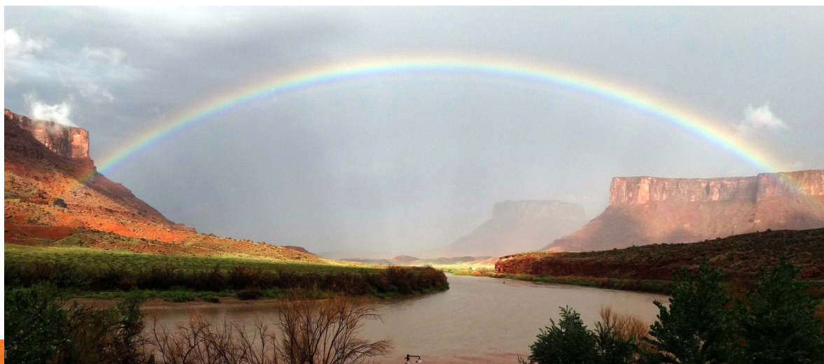
Believe it or not . . . This photo is REAL! Taken on our tour in September, 2014 when we visited Red Cliffs Lodge.